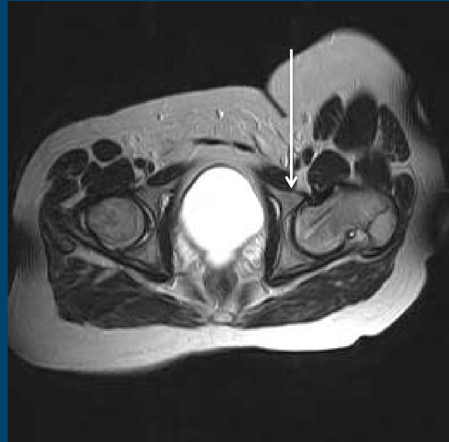
Flexed left hip