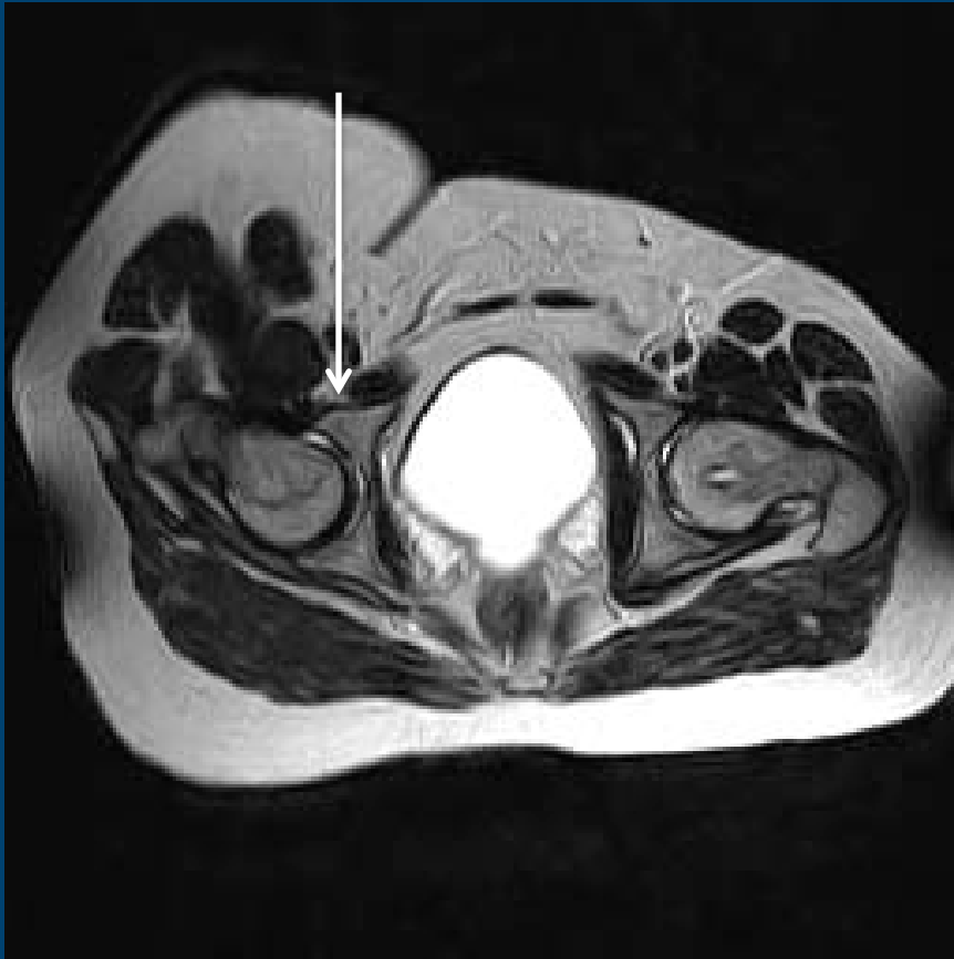
Flexed asymptomatic right hip